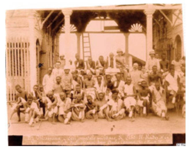
1896 Photo of amputated Eritrean Askari captured at Adwa in a hospital in Massawa.

The opening of the Suez Canal in 1869 turned the Red Sea into a major maritime route linking Europe with the Middle East and the Far East and gave the Red Sea a new strategic significance, fuelling Anglo-French rivalry for its control. Brit-