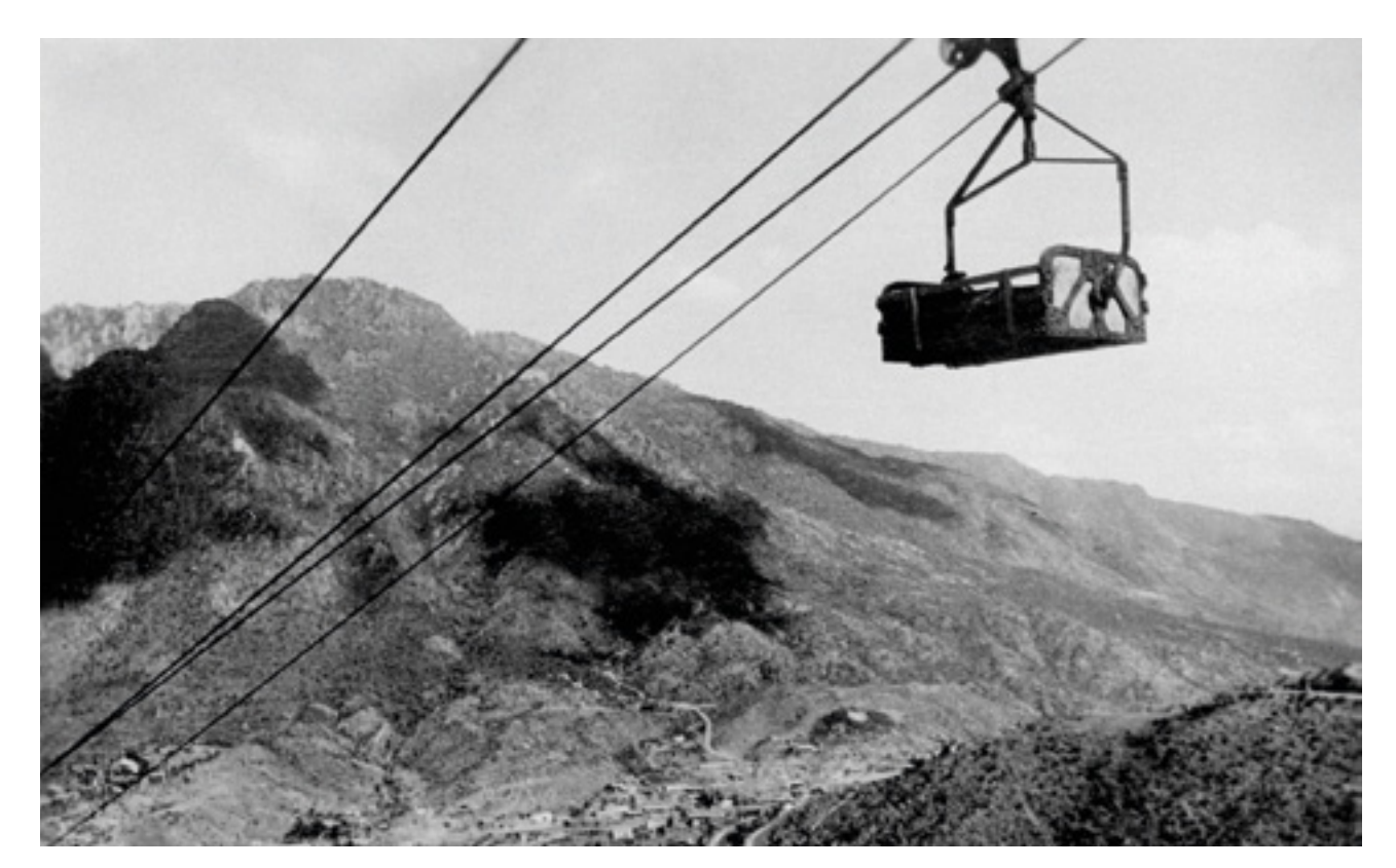
Freight transport in Massaua, Eritrea.

want, and decay today. That the entire city suffers from recurrent and prolonged power outages and water stoppages has worsened the situation for the slum residents.